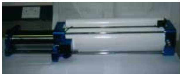
Three-phase AC ServoRam

The publicity that resulted from the entertainment demonstrations of the ram soon led to a surprising variety of enquiries from engineers working in other industries. The PemRam was therefore redesigned mechanically and its electromagnetic systems were reconfigured to meet the demands of industry. It is now generally called a "ServoRam", since it is electrically equivalent to a three-phase AC servomotor. It is possible to construct rams of this design that have peak thrusts from 10 Newtons to at least 20,000 KiloNewtons.