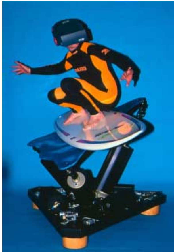
The "Cybersurfer" concept

"The Cybersurfer" photograph became the logo of the electromagnetic ram in the VR industry.