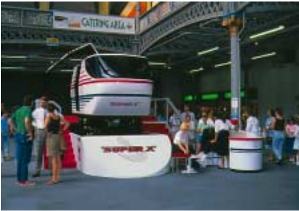
Super X "Venturer" machine

A typical entertainment simulator consists of a small cinema in which a group of between twelve and forty people watch a projected television display and listen to a soundtrack, whilst the whole cinema moves on a hydraulic motion base. As I discovered later, the idea was first conceived by Douglas Trumbull, the special effects film producer, in 1978.