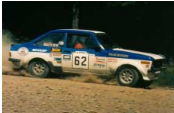
Driving by the seat of the pants

When we take control of a vehicle - for land, sea or air - we bring with us our fast reactions to body forces and we use them to measure our mastery of the vehicle. We deliberately learn how to blend with the vehicle - to feel that it is a natural extension of our body - and to get an instinctive understanding of where the edges of the vehicle are and what is happening to them. By using the controls to move the vehicle, we also gain an ability to predict the future position of the craft and when it is moving we learn how to interpret its interactions with the surrounding medium.