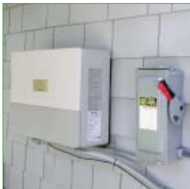
Sharp's 3.5kW inverter is designed with a neutral-toned NEMA 3R housing that integrates into the look of almost any style home.