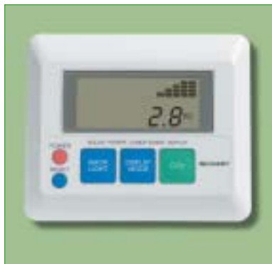
The Sharp solar power LCD display monitor blends beautifully with the homeowner's decor and displays instantaneous and cumulative electricity generation and CO 2 reduction levels.